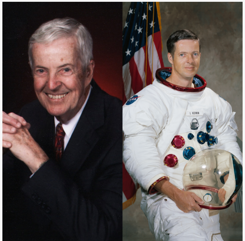
Joe Kerwin, retired NASA astronaut, physician, and author

Dr. Kerwin, having had the unique privilege of viewing Earth from 250 miles up during the first manned Skylab mission in 1973, brings a truly otherworldly perspective to the novel that few others can match. His strong and enduring faith as an Irish Catholic Christian and later training as a healer and space traveler deeply influenced him. Kerwin was intrigued to explore the dual nature of humanity in Finding Eden —our capacity for both heroism and villainy—through the lens of a tale set ten thousand years ago.