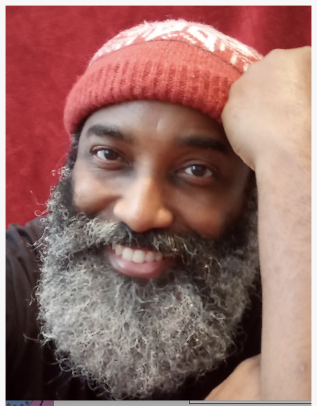
VHYHN QWYHX VHYRZ