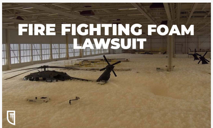
firefighting foam in military hanger causes dangerous exposure