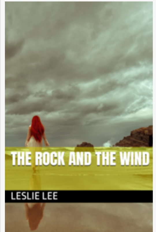
The Rock and the Wind