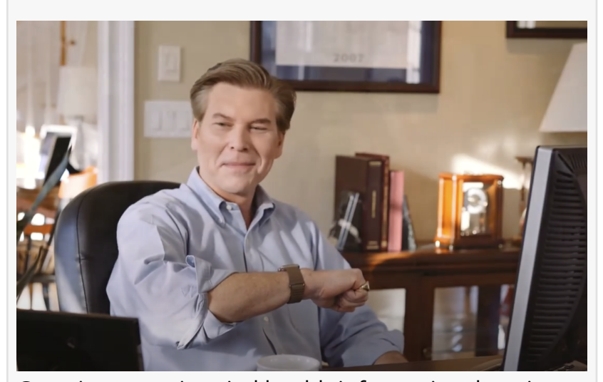
Caregivers receive vital health information, location and peace of mind with ElderCheck

By leveraging the health capabilities unique to Apple Watch and iPhone, ElderCheck Now allows