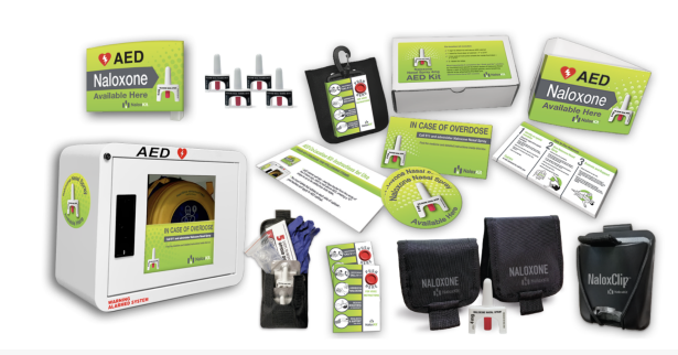
NaloxKit 20% Discount

In support of International Overdose Awareness Day on August 31, we are offering 20% off of all products now until September 6, 2024.