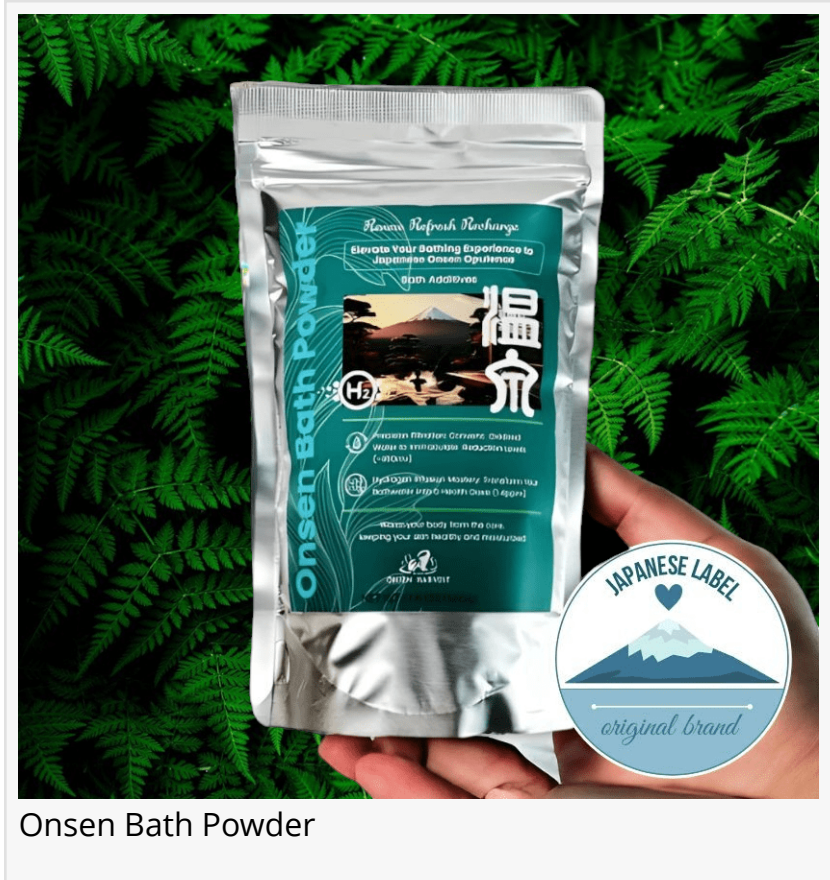
Onsen Bath Powder

Onsen refers to the mineral-rich hot spring water from Japan. It is known for its therapeutic