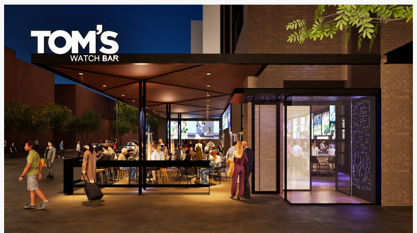
Tom's Watch Bar

Partnerships with local teams create an electric environment with Watch Parties for big games, and many locations have indoor/outdoor bars, expansive patios with screens, and virtual golf suites where customers can play over ten different sports with their party. This innovative approach to transforming the sports bar into an all-encompassing entertainment and dining experience has achieved great success, driving expansion, and the Seattle community is enthusiastically welcoming this exciting addition.