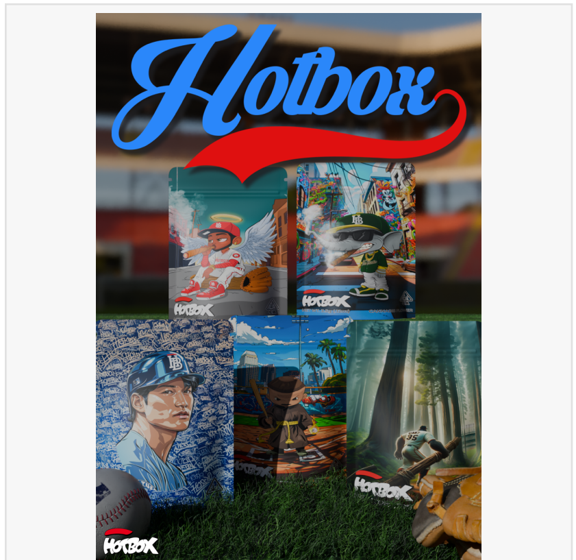
Baseball Series 8th Bag