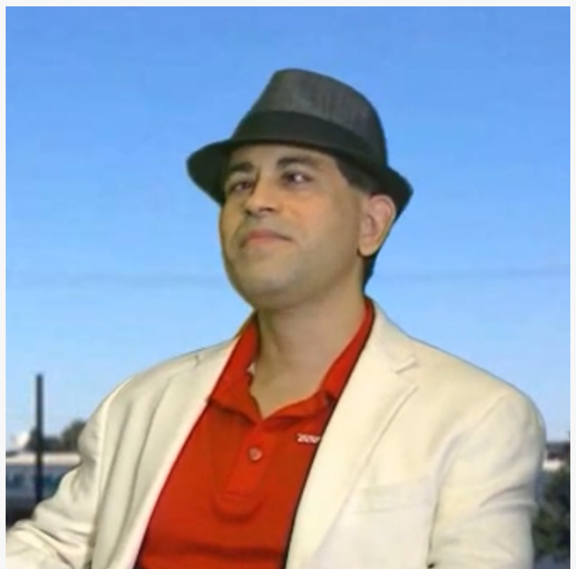
Jorge Zavala: Green Presidential Candidate

Zavala argues that the lack of effective leadership and support from those in power leaves the poor, disabled, and elderly with little recourse but to accept defeat in the face of adversity. He urges community leaders and policymakers to take action to address these systemic issues and ensure that everyone has access to the resources they need to thrive.