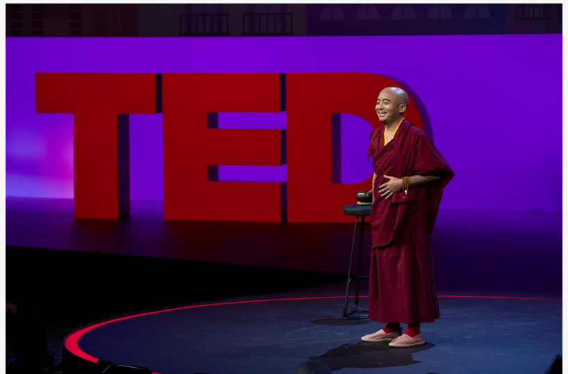
Yongey Mingyur Rinpoche speaks at SESSION 11 at TED2022: A New Era. April 10-14, 2022, Vancouver, BC, Canada.