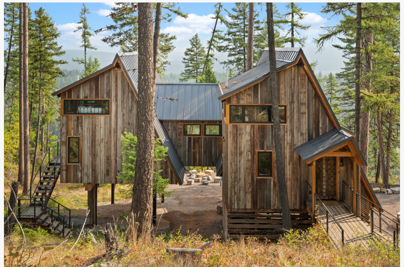
On The Rocks Treehouse, 31 Forest Path Drive, Whitefish, MT 59937