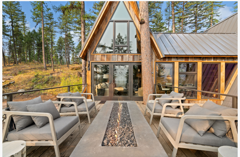
180-degree views of the surrounding mountains and hills