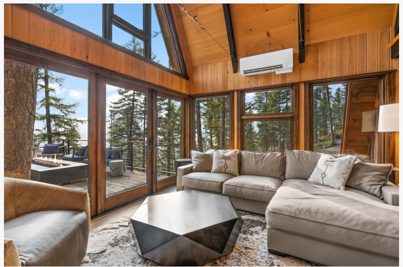
Fully furnished and professionally decorated wilderness retreat