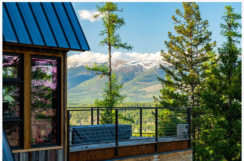
Unique luxury A-frame treehouse home built in 2023 by the Treehouse Masters