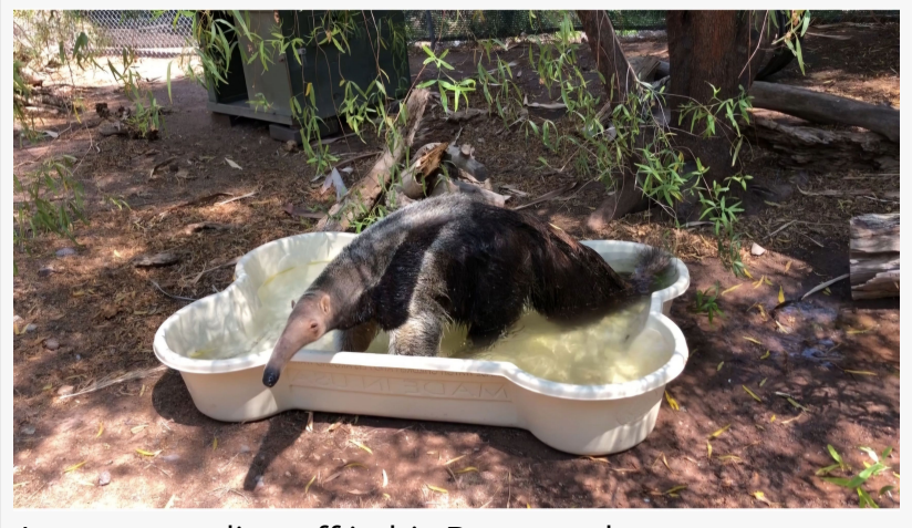
Anteater cooling off in his Bone pool