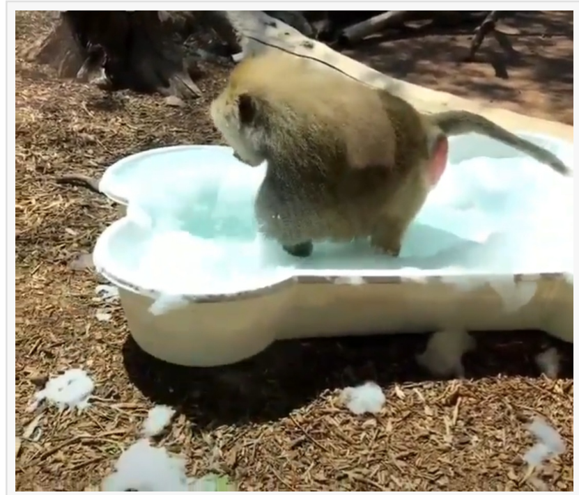
Baboon looking for hidden treasure in the Bone Pool by One Dog One Bone

From the U.S. to Europe and Asia, Bone Pools are making a difference in zoos, sanctuaries, rehabilitation centers, and animal hospitals. These facilities use Bone Pools as enrichment tools for large mammals like lions, tigers, and elephants, allowing them to cool off and engage in playful behaviors. Additionally, sanctuaries and hospitals caring for rescued and injured wildlife, including bears and primates, use Bone Pools as part of their daily care routines.