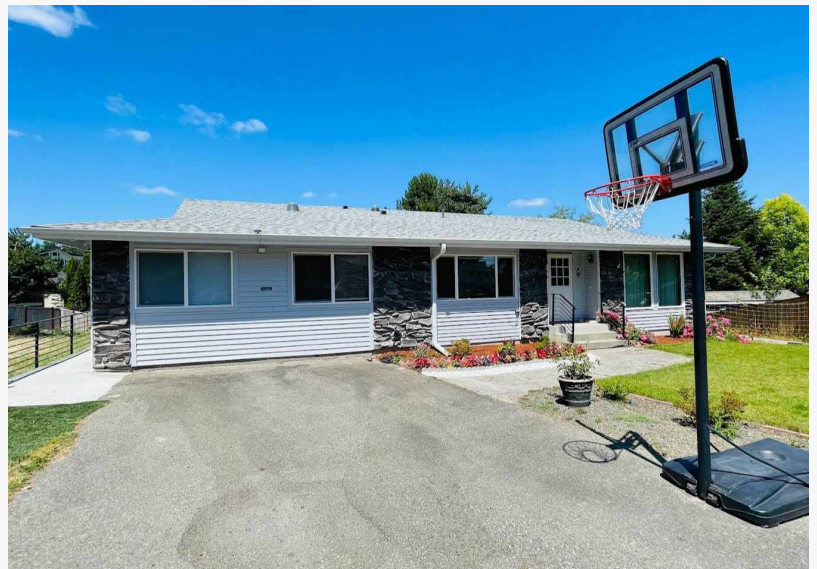
Islandview Adult Family Home another Picture

"The foundation of our philosophy at Islandview is that quality care leads to a quality life," said a