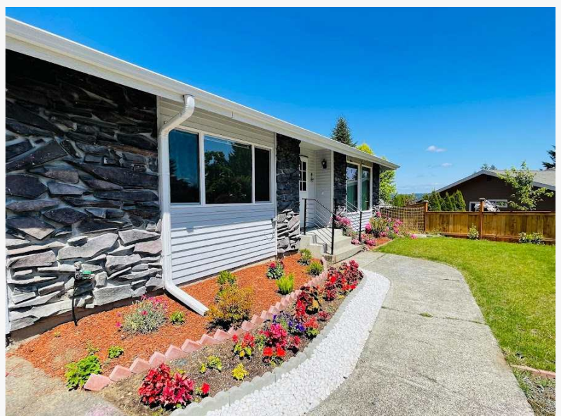
Islandview Adult Family Home

Islandview Adult Family Home stands out among Gig Harbor assisted living facilities for its unwavering dedication to round-the-clock care and compassion. With over 20 years of experience in supporting individuals with dementia and mental health needs, Islandview offers a nurturing environment that prioritizes personalized attention and empathetic understanding. This focus on quality care ensures residents lead fulfilling lives, supported by a team that respects their dignity and independence.