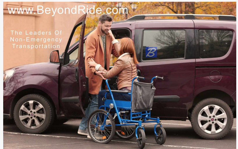
Beyond Ride NEMT VAN Vehicle Another Image