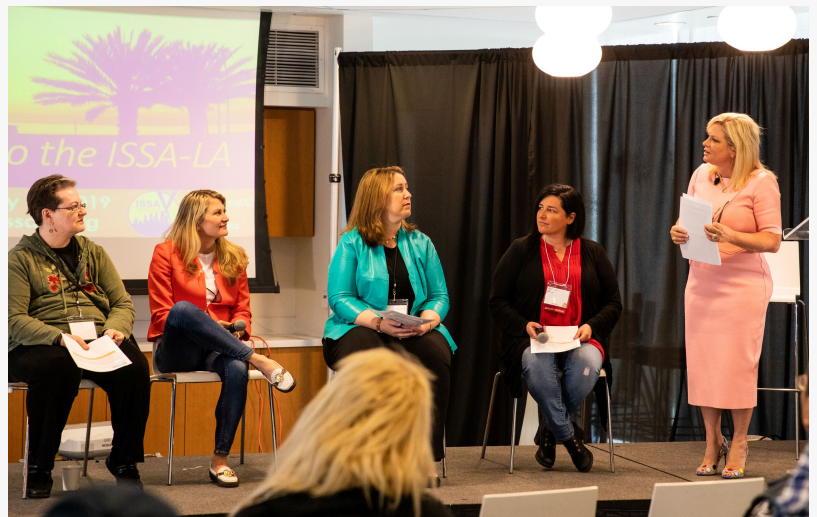
Women in Security Panel