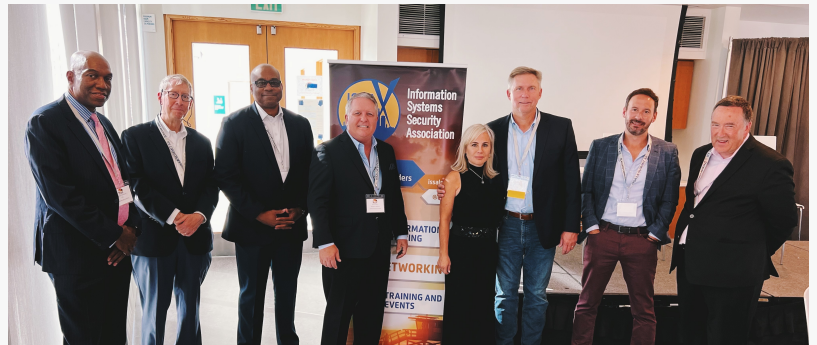
ISSA-LA CISO Forum