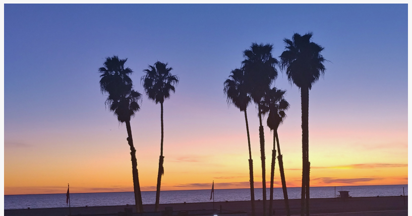
Right at the Beach

CA, UNITED STATES, August 26, 2024 /EINPresswire.com/ -- The Los Angeles Information Systems Security Association (ISSA-LA) is thrilled to announce the Annual Security Summit in conjunction with the Women in Security Forum and CISO Forum . These premier events will take place on October 8-9, 2024, at the Annenberg Community Beach House in Santa Monica, CA.