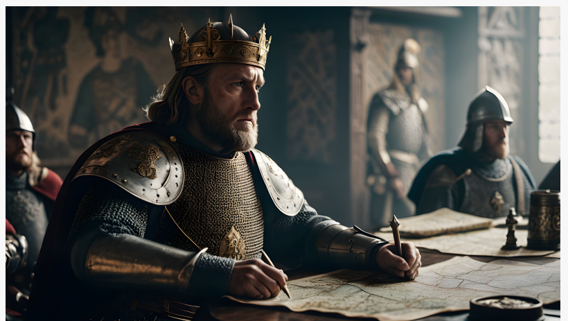
Harold, the Earl of Wessex, is hastily crowned king but faces immediate threats