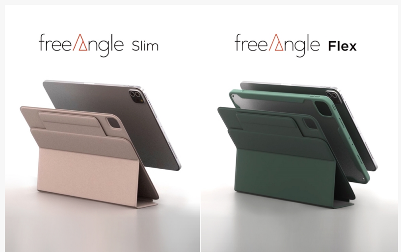
FreeAngle Slim and FreeAngle Flex