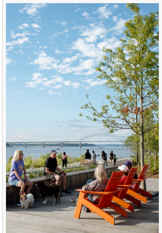
Tom Lee Park has fast become a top destination on the Memphis riverfront

She led the two-year start-up of ArtPlace, a unique public-private collaboration to accelerate