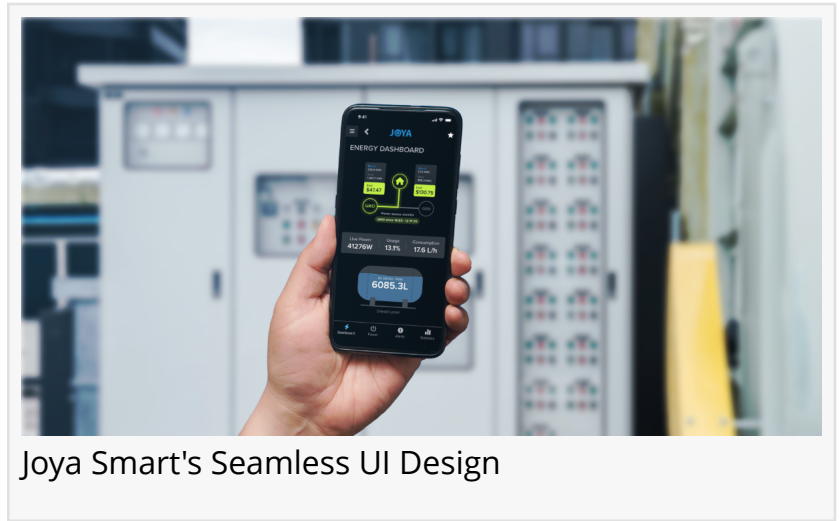
Joya Smart's Seamless UI Design