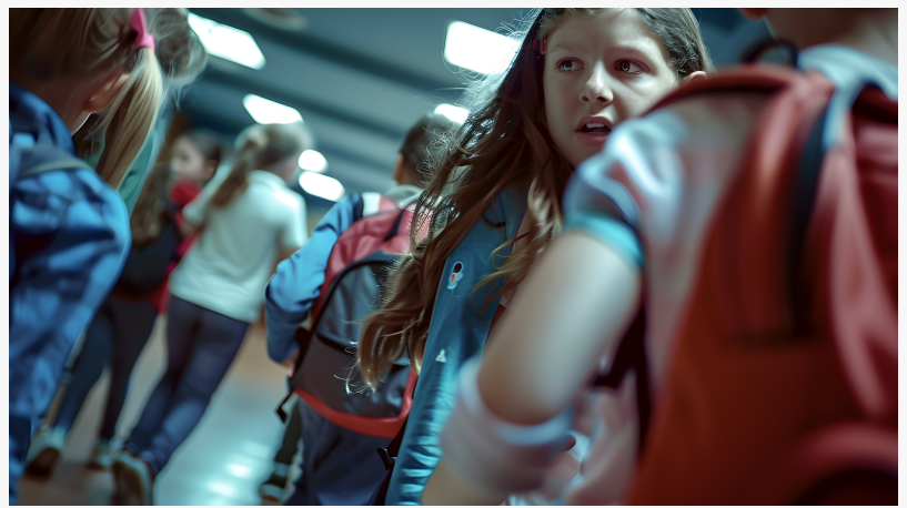
Stand For The Silent

Started in 2010, Stand for the Silent is an organization on a mission to help eliminate bullying