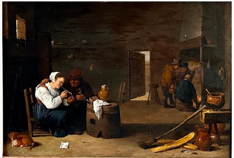
Oil on canvas painting attributed to David Teniers II (Dutch, 1610-1690), titled Tavern Interior with Woman Smoking and Man Drinking, signed "Teniers" (est. $20,000-$30,000).