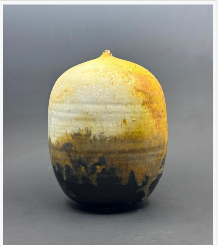
Circa 1980s closed form Anagma fired stoneware by Toshiko Takaezu (1922-2011), yellow and ochre glaze flowing down over a warm brown glaze, 7 ¼ inches tall (est. $6,000-$8,000).