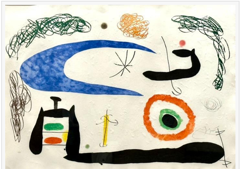
Etching, aquatint, drypoint and carborundum on Arches paper by Joan Miro (Spanish, 1893-1983), titled Dormir Sous La Lune (1969), artist signed and numbered (est. $8,000-$12,000).

Jewelry offerings will be plentiful, to include a circa 1970s gold retro link bracelet weighing 75 grams of 18k yellow gold, hallmarked (est. $5,000-$7,000); a 22k Etruscan Revival bracelet with two teardrop-shaped emeralds, bezel shaped (est.