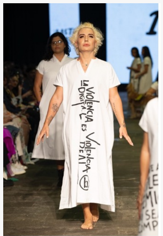
Elton Ilirjani for the UNFPA Bodyright Campaign