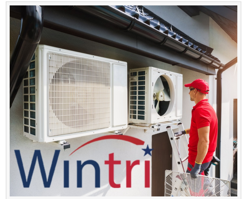
Free HVAC Diagnostic Services

According to Wintri's lead technician, "Our diagnostic service is not just about identifying problems—it's about preventing them. We believe in the importance of maintaining a healthy HVAC system to ensure that our customers' homes remain comfortable year-round. By offering this service for free, we are helping our community stay ahead of potential issues."