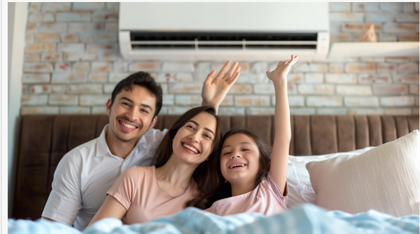
Professional HVAC Repair by Wintri

<u>Wintri has been a cornerstone in the Covina community for years</u>, providing reliable HVAC services that cover a wide range of needs, from routine maintenance and emergency repairs to