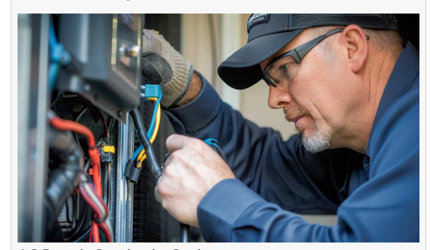
AC Repair Service in Covina