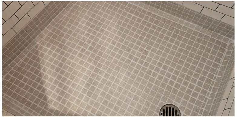
Grout Repair and Restoration