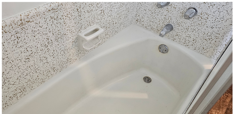
Hollywood tile restoration and regrouting