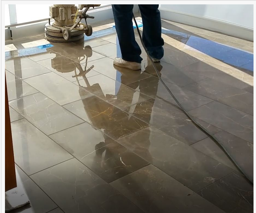
Stone restoration and polishing

Stone restoration is a specialized process that involves the careful repair, cleaning, and rejuvenation of natural stone surfaces. These surfaces, which include marble, granite, limestone, travertine, and others, require meticulous care to restore their original beauty. Stone restoration not only enhances the visual appeal of these surfaces but also extends their lifespan, making it a valuable investment for property owners in Van