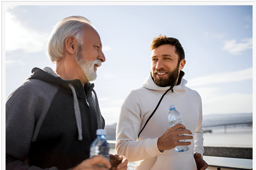
Mature and young man jogging on a bridge talking

/EINPresswire.com/ -- R3 Stem Cell is making a big difference for people in Los Angeles who are dealing with pain and other health problems. If you've been struggling with joint pain or other conditions, R3 Stem Cell might have the solution you've been looking for.