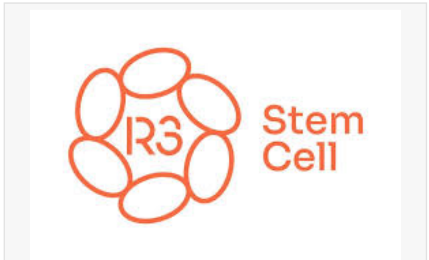
R3 Stem Cell Logo