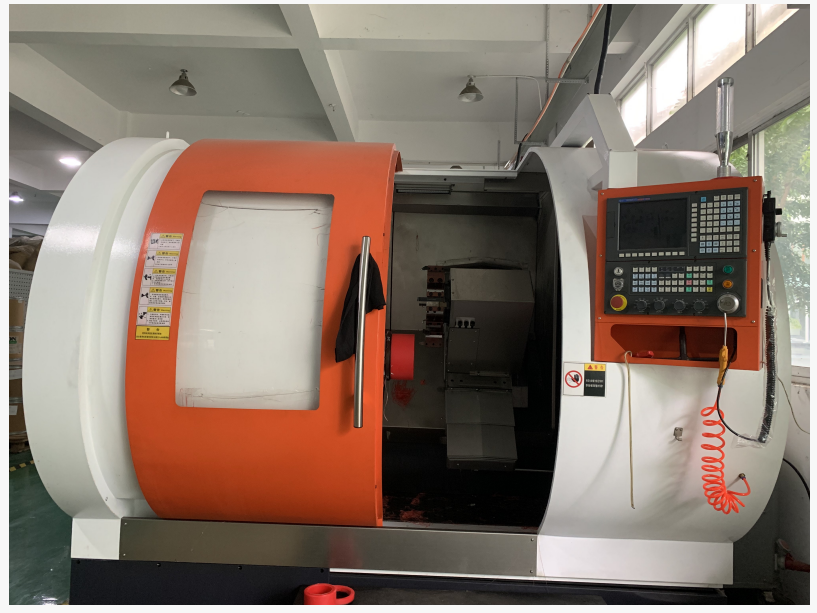
Advanced CNC machines for seals

One-Click Program Generation: Simplifies the production process by allowing machining