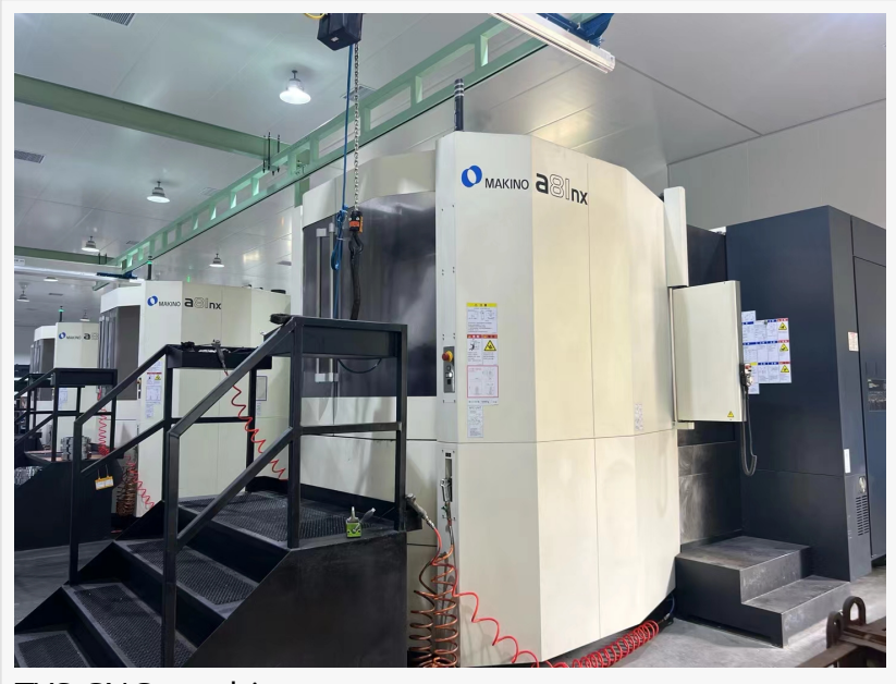
TYS CNC machine

This acquisition underscores TYS's commitment to advancing its manufacturing capabilities and providing top-tier sealing solutions to its customers with competitive price. Visit<sup>®</sup><u>https://www.tysseals.com/</u> TYS in Jimei District, Xiamen City, China.