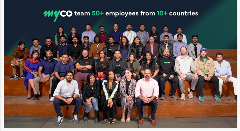
UAE based Web3 streaming platform myco raises $10 million for its Series A funding

Daman Investments as an Advisory Partner and Seed Investor, and Republic Crypto as a Web3 Advisor. Last month, myco reported its first profitable year, with an EBITDA of $1 million and revenue of $7.5 million for the 2023-24 fiscal year.