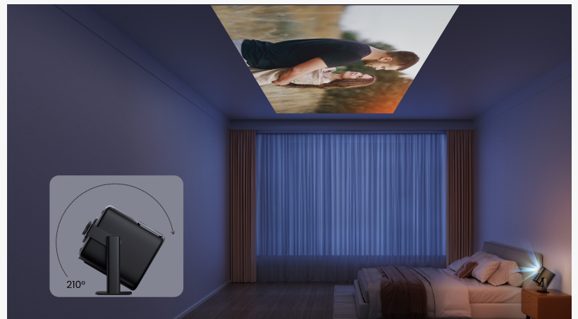
Dangbei N2 | Flexible Viewing Angles

Projectors allow users to adjust the screen size based on the available space or personal preference. This flexibility is particularly useful for multi-purpose rooms, allowing the screen size to be adapted to different settings, from intimate gatherings to larger home theater experiences. TVs, on the other hand, are fixed in size and less adaptable to varying environments.