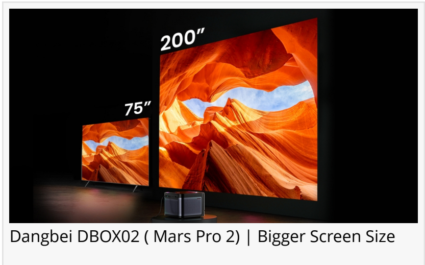
Dangbei DBOX02 ( Mars Pro 2) | Bigger Screen Size

/EINPresswire.com/ -- Dangbei, an innovator in smart entertainment, is excited to announce the release of their blog post highlighting 10 reasons to replace a TV with a projector. They encourage readers to explore this innovative option for a fresh way to enjoy their favorite content.