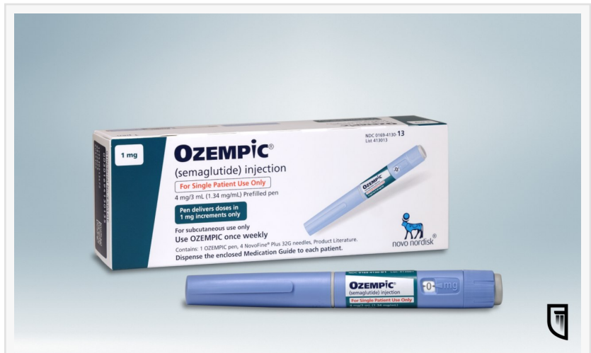
ozempic lawsuit product overview