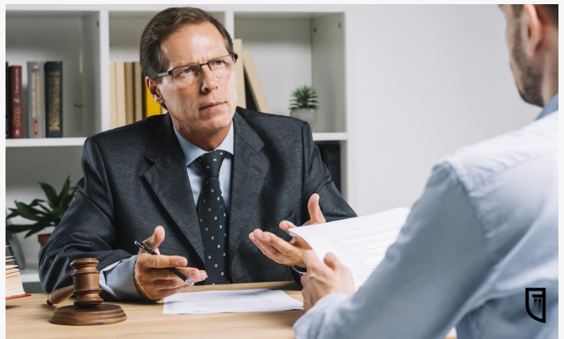
ozempic lawsuit attorney

This press release can be viewed online at: https://www.einpresswire.com/article/738581234