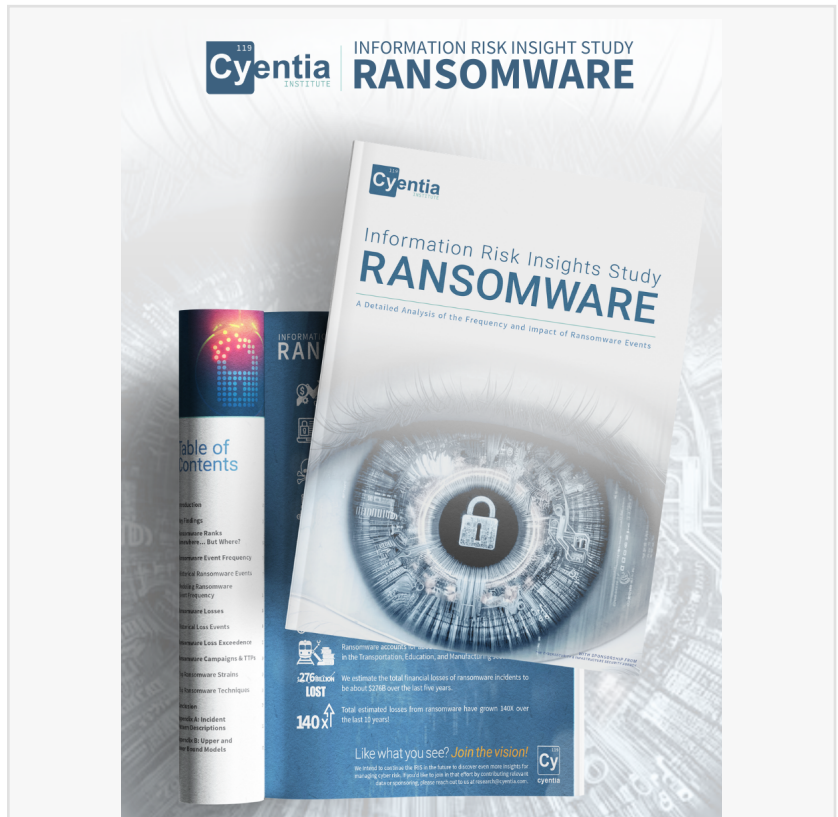
The Information Risk Insights Study: Ransomware

Ransomware continues to cast a looming shadow over the digital landscape, sparking widespread apprehension and concern among organizations. With headlines regularly broadcasting the devastating impact of these attacks, it's no wonder that businesses are on high alert. The fear of becoming the next victim, coupled with the uncertainty of attack likelihood and doubts about the effectiveness of existing defenses, has created a challenging environment for decision-makers.