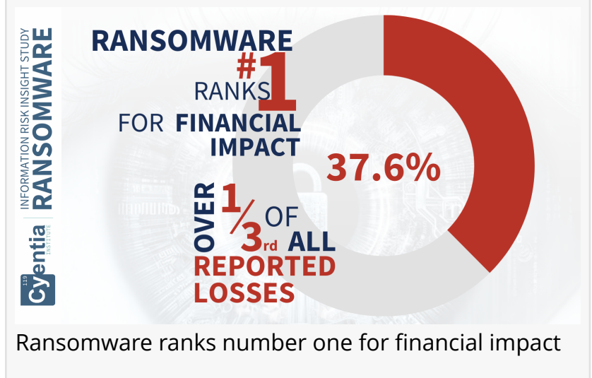
Ransomware ranks number one for financial impact