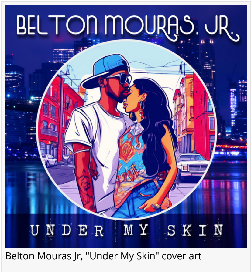
Belton Mouras Jr, "Under My Skin" cover art

EINPresswire.com/ -- Belton Mouras Entertainment continues to elevate the art of storytelling through music with the release of their latest music video, "Under My Skin." Crafted by the talented composer, pianist, and producer Belton Mouras, Jr., this evocative love song delves into the lives of two people from vastly different worlds. In a narrative reminiscent of a modern-day *Romeo and Juliet*, a hip-hop artist crosses paths with a sophisticated jazz singer, and together they explore their emotions and connection through the universal language of music.