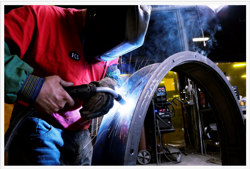
Kelair Dampers Welder in our Bellwood, IL facility