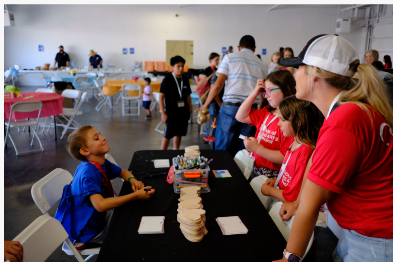
Ace of Hearts Project - Youth Driven Non-Profit

This press release can be viewed online at: https://www.einpresswire.com/article/738673003