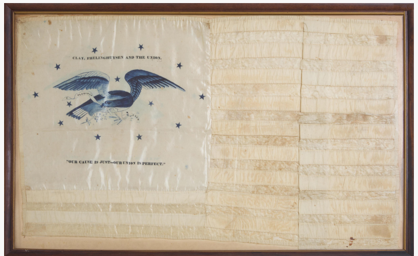
This Henry Clay (1777-1852) presidential campaign flag from 1844 is partially folded and presented behind glass in a wooden frame. It has an estimate of $5,000-$9,000.