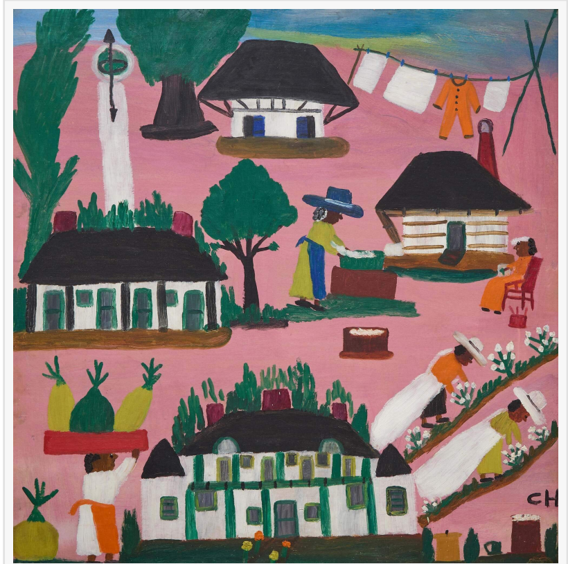
Oil on board painting by the renowned Black folk artist Clementine Hunter (1887-1988), titled Melrose Plantation (est. $7,000-$10,000), one of nine paintings by Ms. Hunter in the auction.

Clementine Hunter was a self-taught Black folk artist from the Cane River region of Louisiana who lived and worked on Melrose Plantation. Her oil on board painting titled Melrose Plantation is expected to realize $7,000-$10,000, while another painting by the famed artist, a circa 1977 work titled Saturday Night Juke Joint with Card Game, should change hands for $5,000-$8,000. Note: there are nine original paintings by Clementine Hunter in the auction.