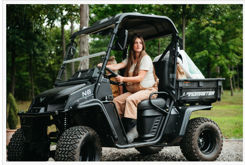
Landmaster Classic Edition