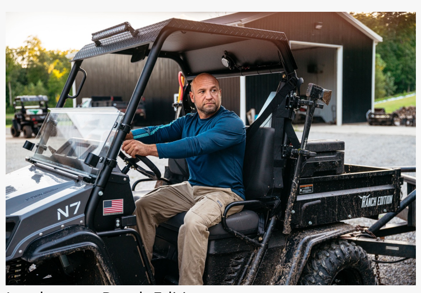
Landmaster Ranch Edition

stage of production process, and 100% assembled UTVs delivered to their dealer network.