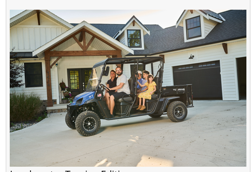
Landmaster Touring Edition