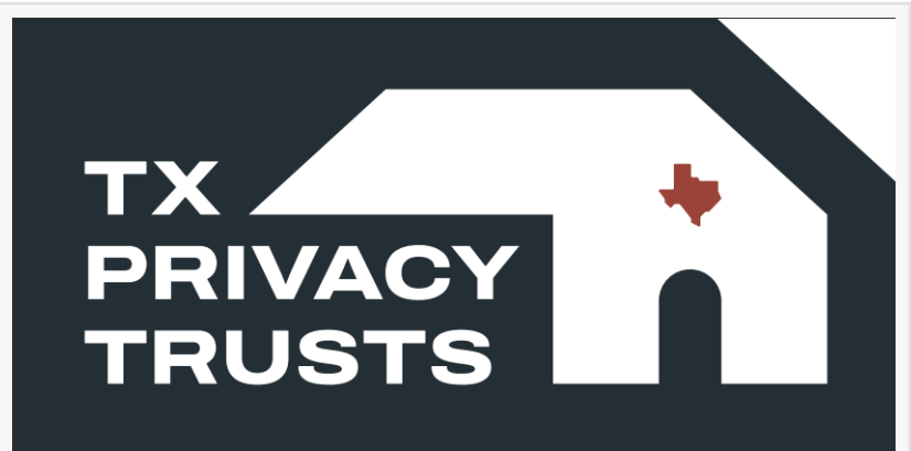
Texas Privacy Trusts in Austin, TX

Real estate privacy trusts can provide a way to buy and operate residential , commercial, agricultural, and other property in Texas while keeping personal names and/or businesses' identities out of public records.