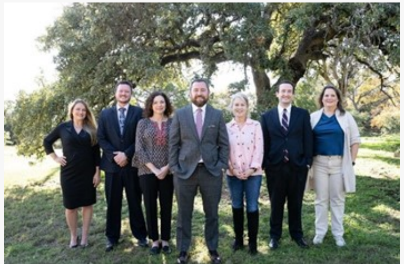
REPT Lawyers & Staff at Texas Privacy Trusts