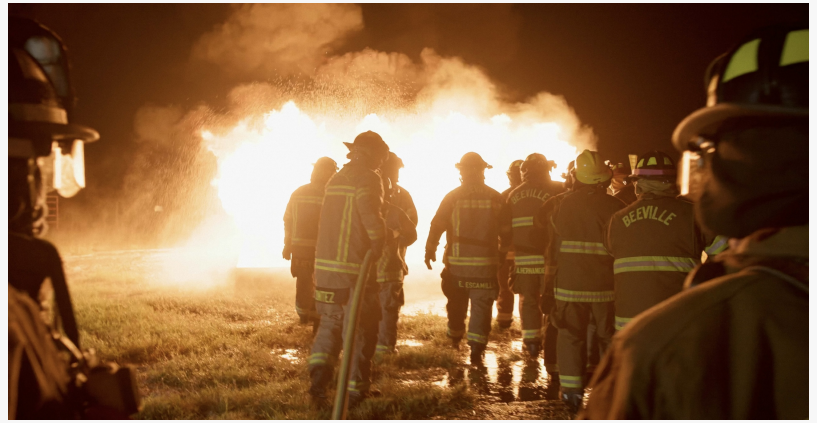
Photo 3 "Odd Hours, No Pay, Cool Hat" DOC (Beeville_FireTraining_04)