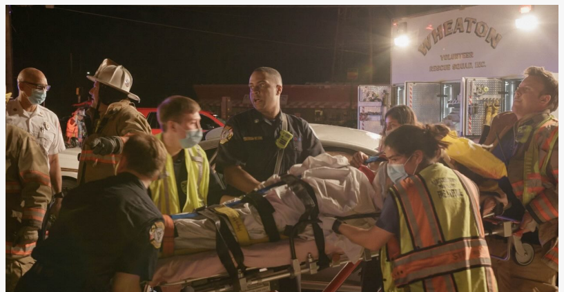
Photo 1 "Odd Hours, No Pay, Cool Hat" DOC (Wheaton_AccidentScene_Zach_01)