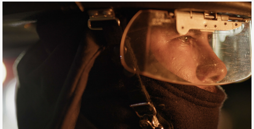
Photo 4 "Odd Hours, No Pay, Cool Hat" DOC (Beeville_FireTraining_05)