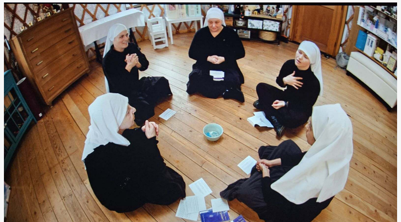
The craft-yurt, which doubles as a place out of the sun for prayer

This press release can be viewed online at: https://www.einpresswire.com/article/738980904