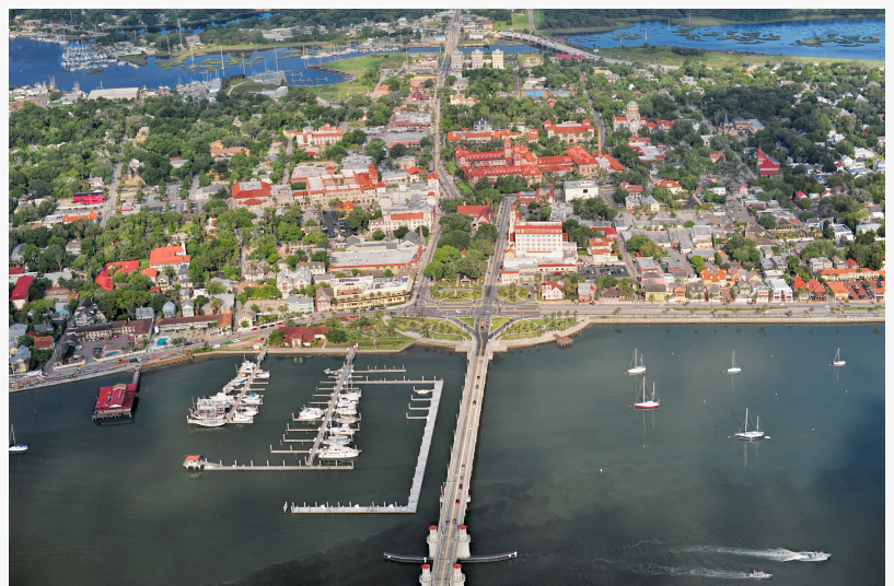
The skyline of St. Augustine reflects the Nation's oldest city's European influences.