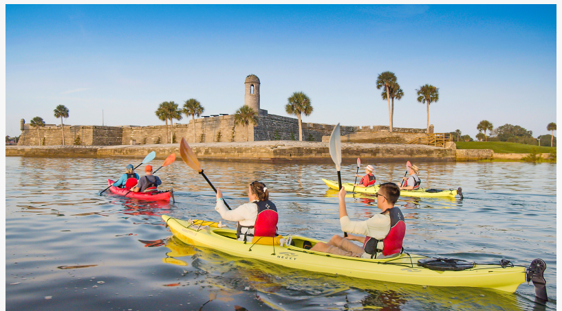
Paddling on the Matanzas Bay with the Castillo de San Marcos is just one of the unique experiences waiting for visitors to Florida's Historic Coast.