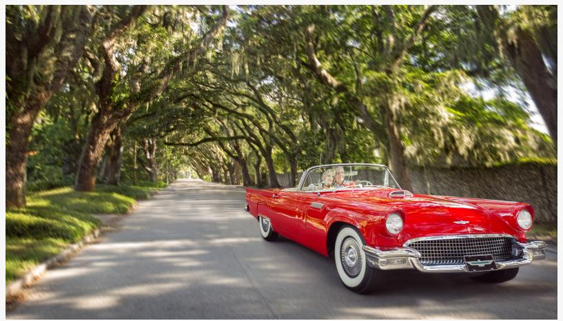
Magnolia Avenue in St. Augustine Florida is one of the most scenic streets in the Nation's oldest city.

Located midway between Daytona Beach and Jacksonville, Florida's Historic Coast includes historic St. Augustine, the outstanding golf and seaside elegance of Ponte Vedra, the