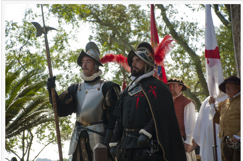
Pedro Menendez, founder of St. Augustine, Florida, arrived on September 8, 1565

ST. AUGUSTINE, FLORIDA, US, August 28, 2024 /EINPresswire.com/ -- Florida is home to hundreds of ships departing for destinations far and wide. Just a short drive from two of the state's major ports (Port Canaveral and Jacksonville), Florida's Historic Coast has launched a new dedicated webpage to help travelers extend any cruise with a memorable Florida experience.