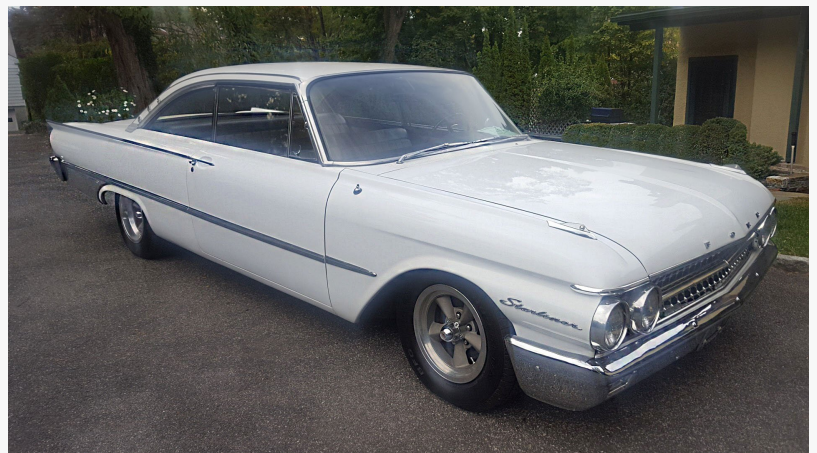
Lot 1: 1961 Ford Galaxie Starliner Bubbletop