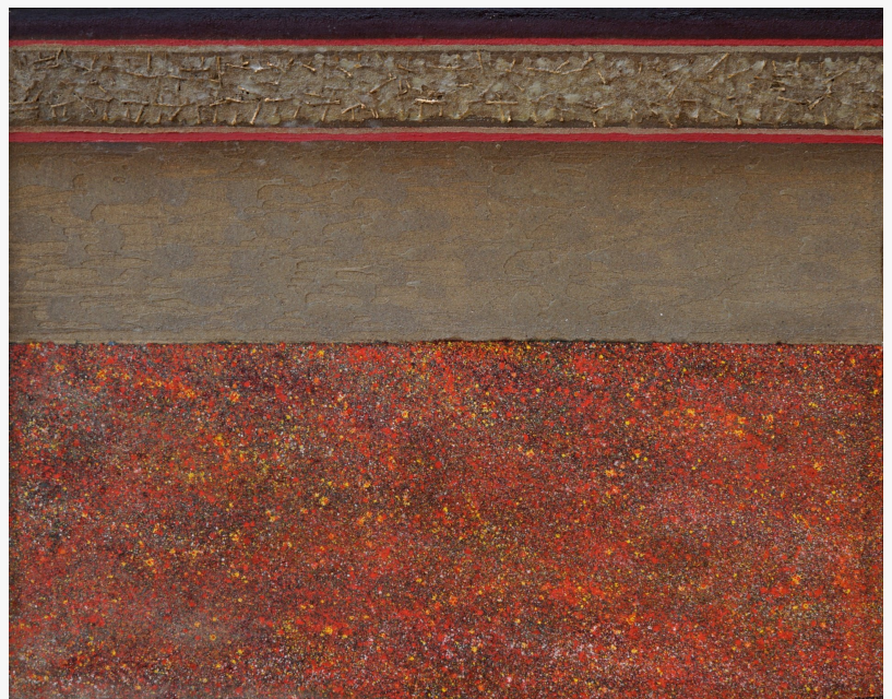
Lot 83: Vincent D. Smith - Obeisance For Biko - 1985

This expansive canvas exemplifies Smith's ability to capture the essence of the black experience. Additionally, 'Root Detour,' from his 'Dry Bones' series, estimated at $10,000 - $15,000, powerfully explores themes of endurance and survival.