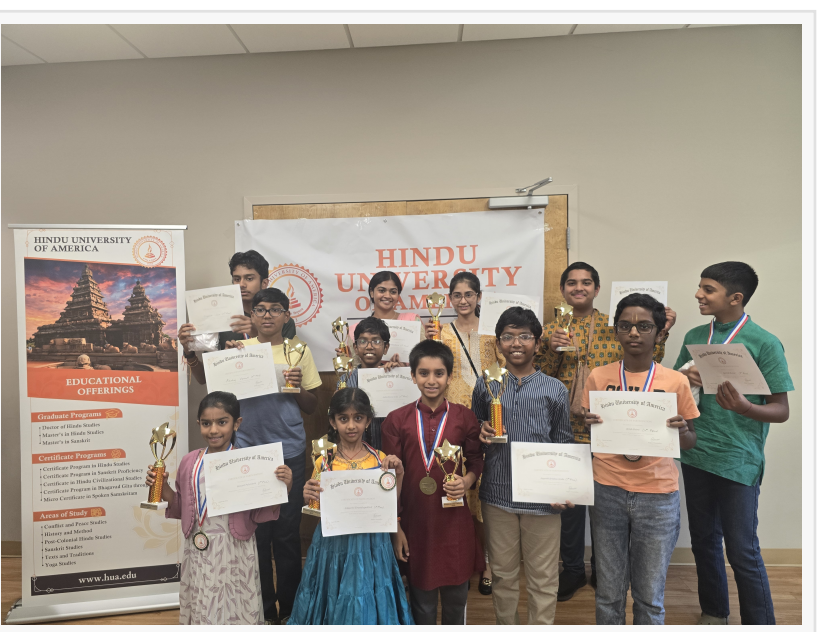
The winners of the 2nd Annual Bhagavad Gita Pariksha Context at the Hindu Society of North Carolina

MORRISVILLE, NORTH CAROLINA, UNITED STATES OF AMERICA, August 29, 2024 /EINPresswire.com/ -- Fifty-One (51) students from North Carolina, mostly from the Triangle Area participated in this year's <u>Bhagavad</u> <u>Gītā</u> Pariksha (BGP) competition on August 24th. Over 200 members of the community attended to cheer the students and a $10,000 prize pool was awarded to the winners who showed exemplary knowledge and understanding of the Bhagavad Gītā.