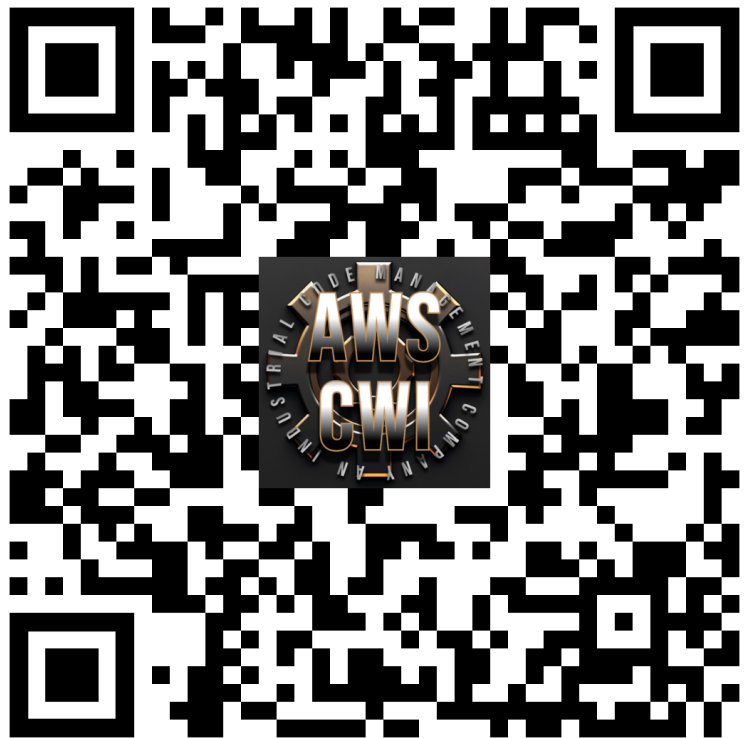
QR Code for AWSCWI.COM Tulsa Welding Inspection Service