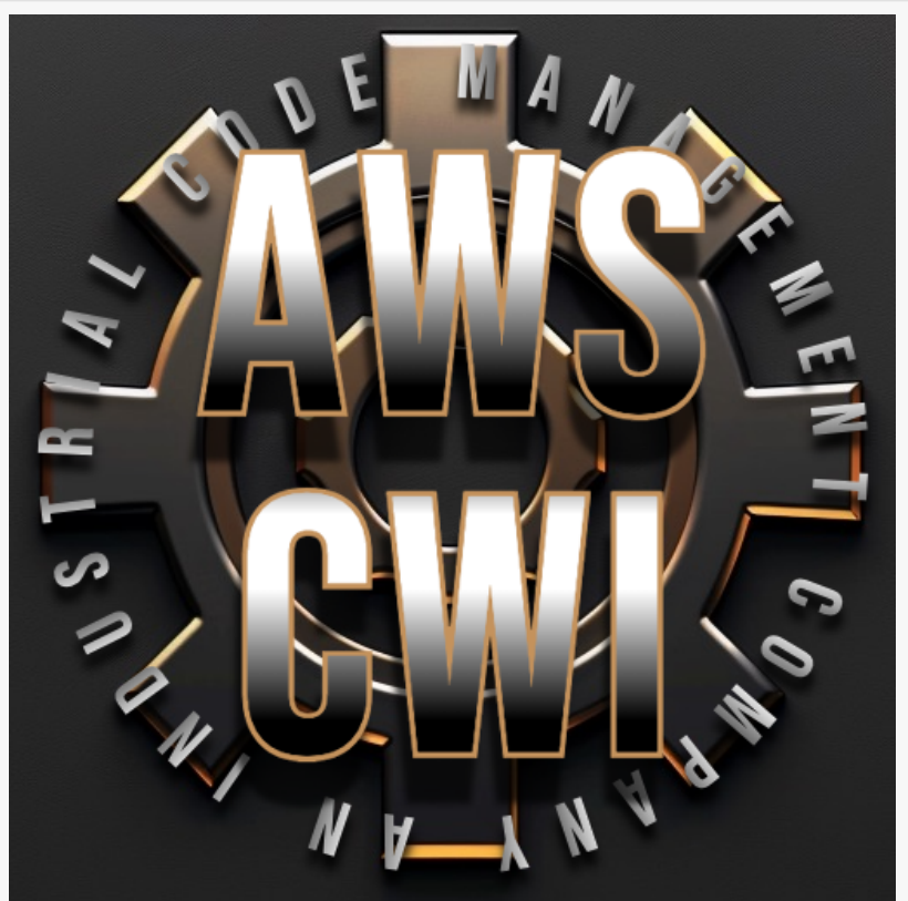
AWSCWI.COM Website Logo