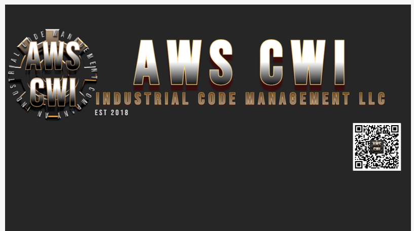
AWSCWI.COM Expands Welding Inspection Services in Tulsa for Top-Quality and Compliance

AWSCWI.COM's Tulsa Oklahoma AWS CWI inspectors are highly trained professionals equipped to address the specific needs of project owners, general contractors, and subcontractors: