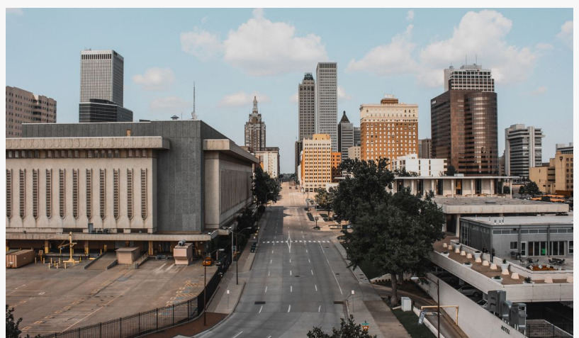
AWSCWI.COM Expands Tulsa Services for Superior Welding Inspection and Compliance