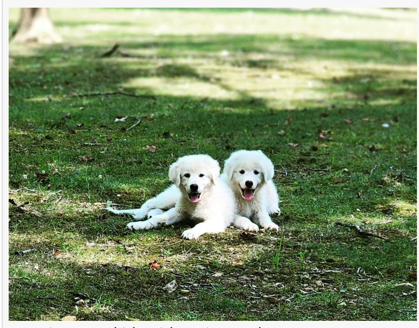
Puppies at Ankida Ridge Vineyards

This press release can be viewed online at: https://www.einpresswire.com/article/739320951