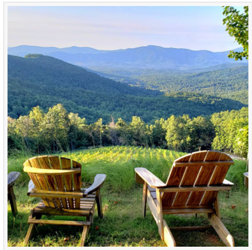
Overlooking the Ankida Ridge Vineyard