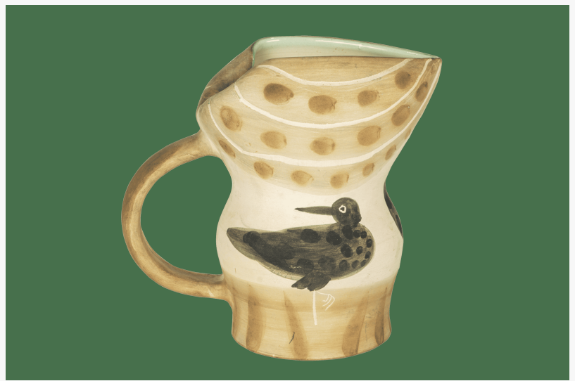
Pablo Picasso (Spanish, 1881-1973), " Piquet Gothique aux Oiseaux ," 1953, terre de faïence pitcher painted in colors with partial glaze. Estimate: $8,000 / 12,000