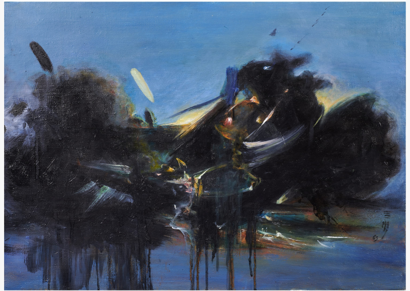
Cheong Soo Pieng (Singaporean, 1917-1983), Untitled, 1963, oil on canvas, signed (in Chinese). Estimate: $15,000 / 20,000