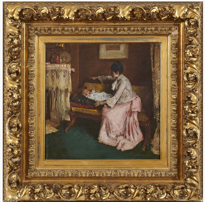
William Merritt Chase, A Mother's Joy (1889). Estimate $600,000 / $900,000.