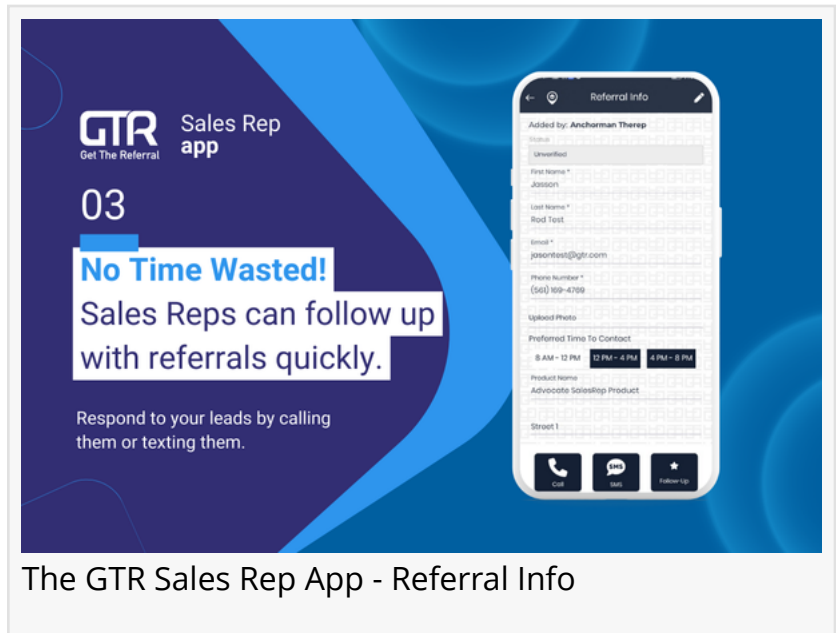
The GTR Sales Rep App - Referral Info

* Nurture Advocate Relationships: Strengthening relationships with Advocates is easier than ever, driving even more referrals and boosting overall business growth.