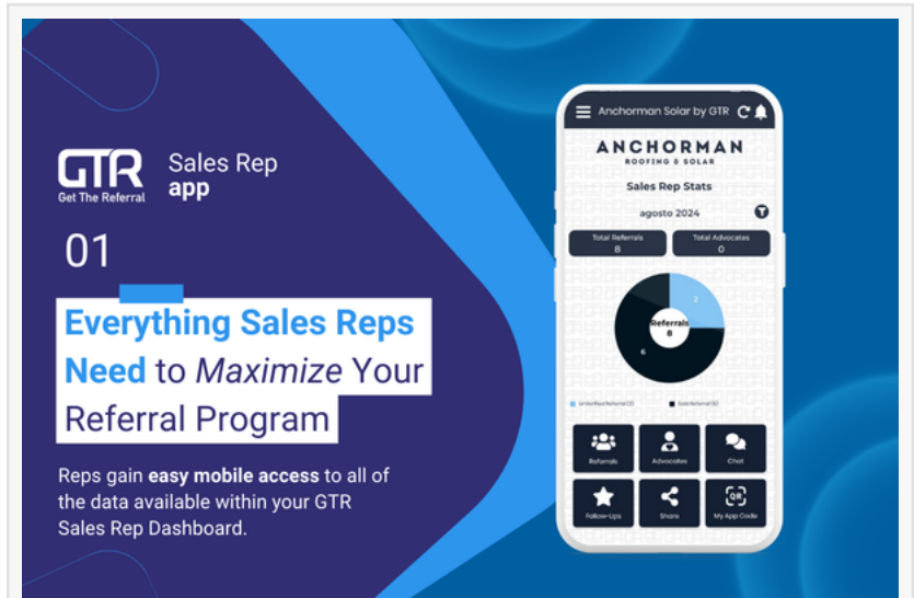
The GTR Sales Rep App