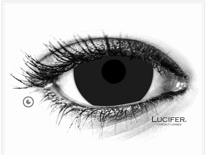
Mini Black Sclera - www.sclera-lenses.com

We are also excited to introduce our new line of scary contacts . These unique lenses are designed to give your eyes a chilling, unforgettable look, perfect for Halloween, horror events, or just to surprise your friends. With a variety of designs ranging from blood-red eyes to eerie, ghostly whites, our scary contacts offer something for every thrill-seeker. Crafted with comfort and safety in mind, these lenses ensure you not only look terrifying but also feel great wearing them. Elevate your next costume or night out with a pair of our scary contacts and leave a lasting impression!