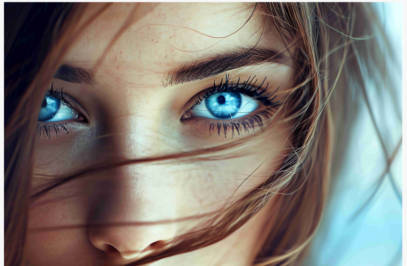
Colored contacts - www.sclera-lenses.com