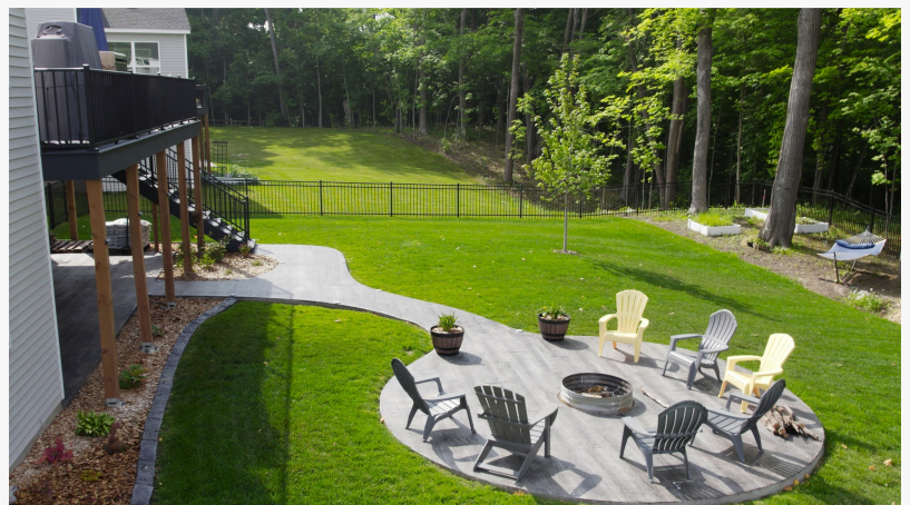
4' Ornamental Steel Fence