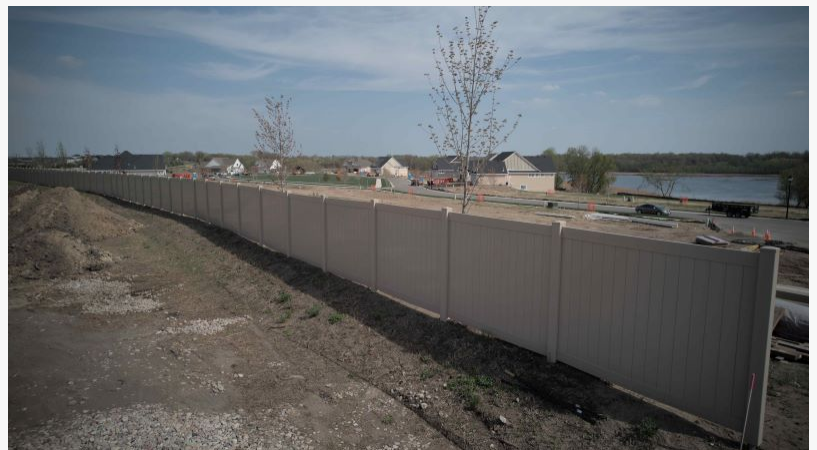
Khaki Vinyl Privacy Fence