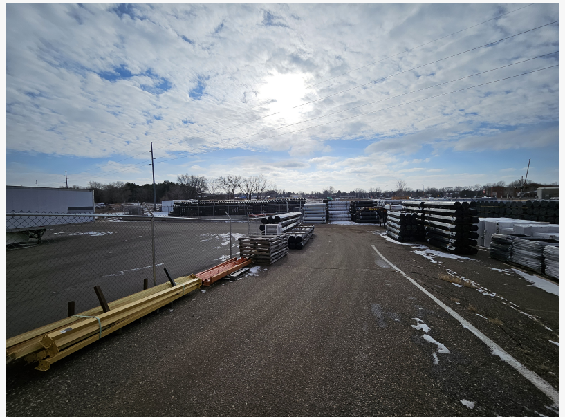
Steel Pipe in stock ready for shipping