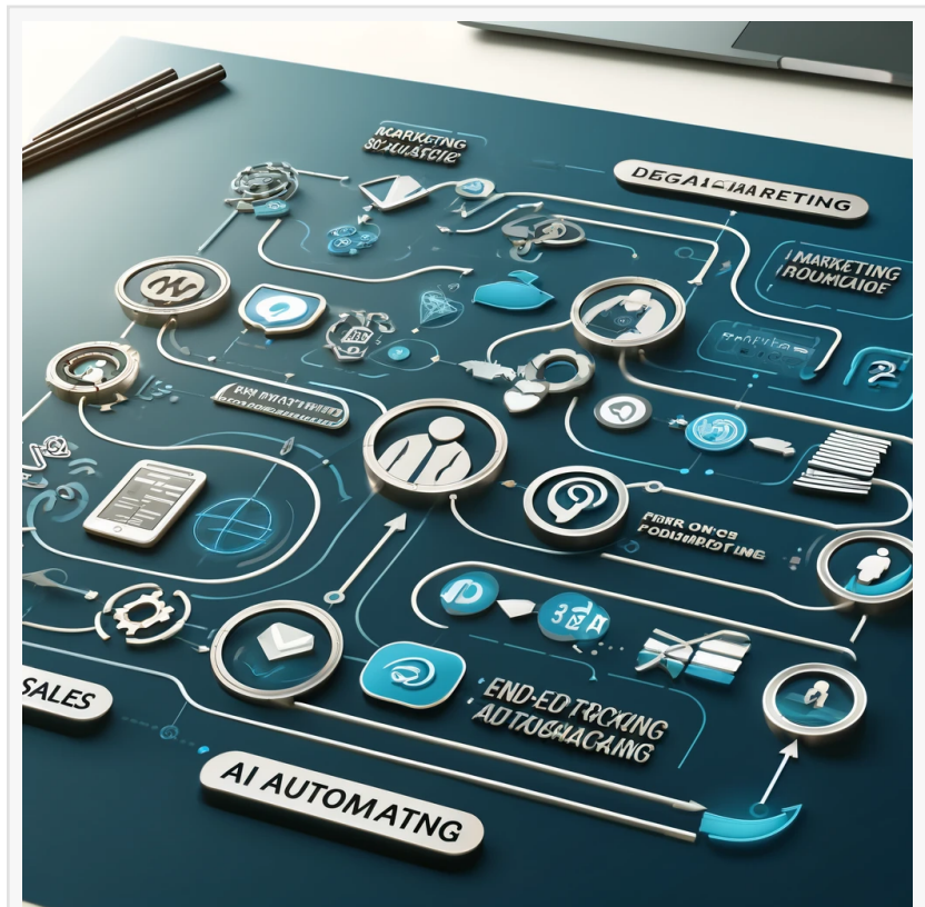
Austin SEO Company 2025

Operational Automation: Enhancing productivity with automated processes that span multiple departments.