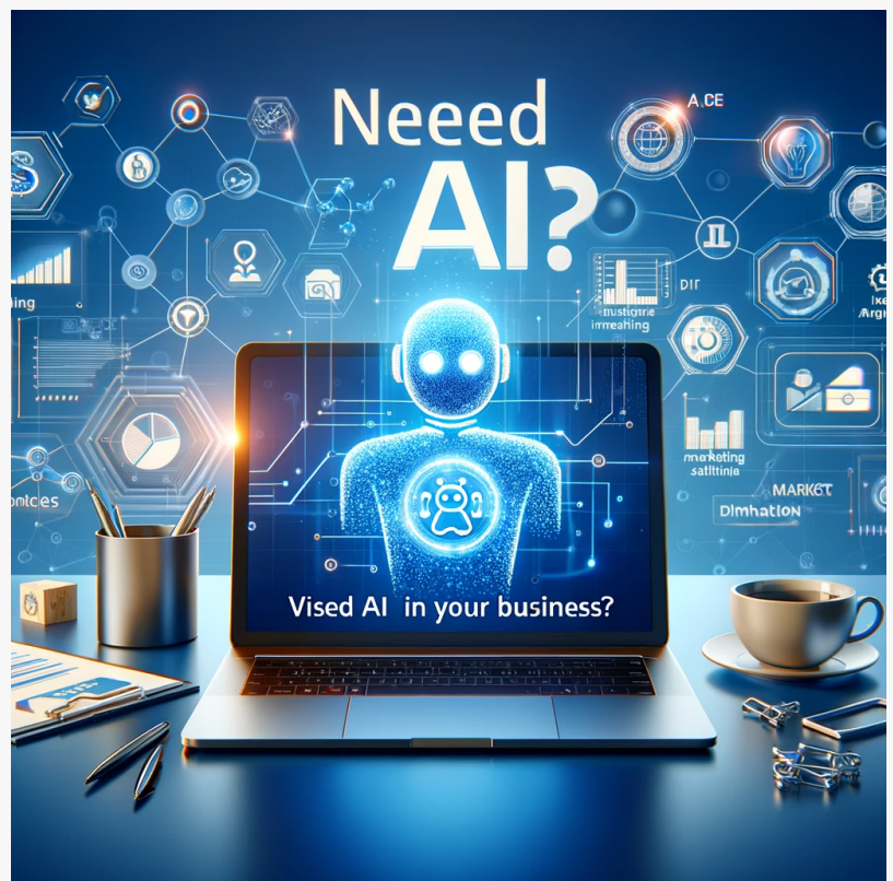
Ai for business marketing sales