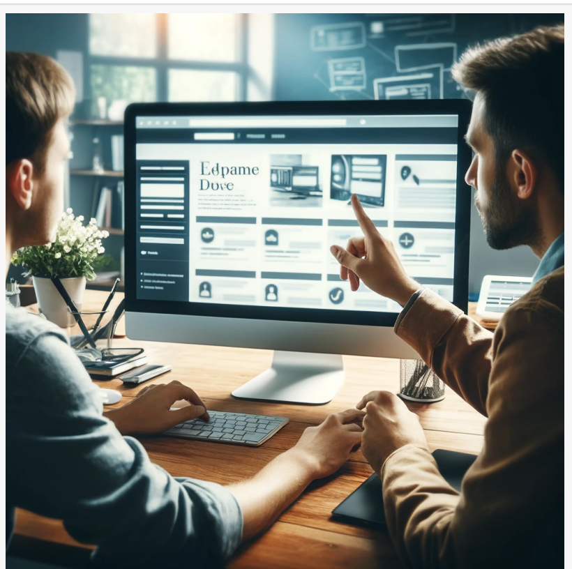
Austin website fix

Content Marketing: Creating compelling content that resonates with target audiences.