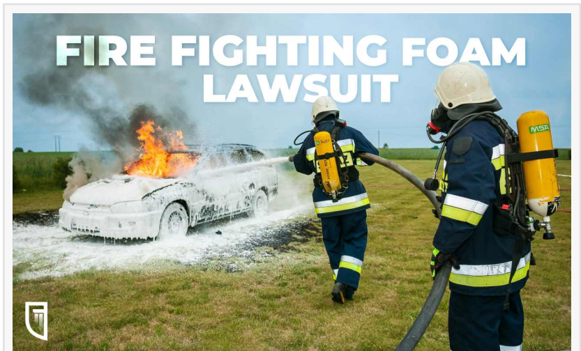
firefighting foam lawsuit