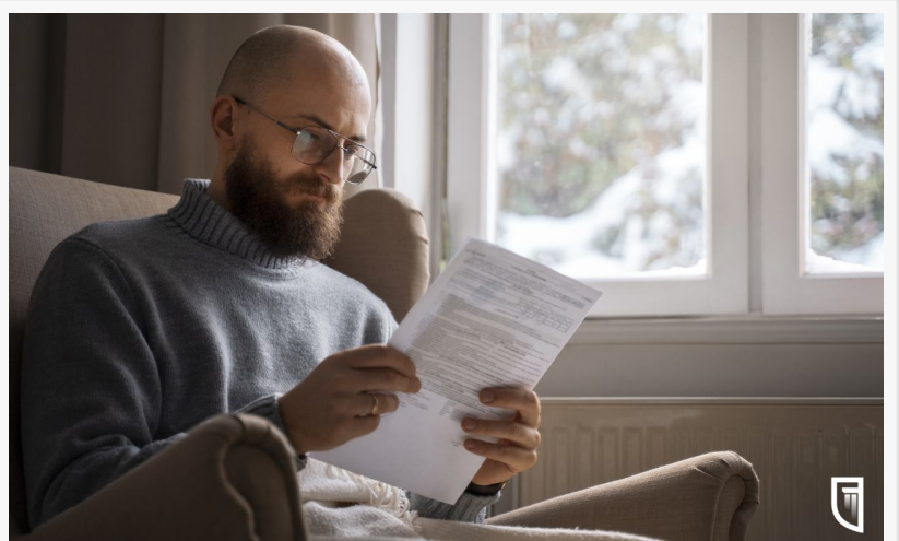
firefighter reading report about firefighting foam

MIAMI, FLORIDA, USA, September 2, 2024 /EINPresswire.com/ -- Recent studies have revealed a frightening link between AFFF firefighting foam and thyroid disease . AFFF, or aqueous film-forming foam, has long been used by firefighters to extinguish fires, but new evidence shows that the chemicals in this foam may have serious health consequences. This alarming discovery has sparked concern among health experts and has led to legal action by those affected.