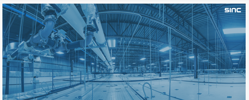
Sinc Product Information Management PIM Platform

NEWCASTLE UPON TYNE, TYNE AND WEAR, UNITED KINGDOM, September 2, 2024 /EINPresswire.com/ -- bimstore, the leading designers and hosts of BIM, are excited to announce the launch of Sinc, an innovative new Product Information Management (PIM) platform, developed exclusively for manufacturers.